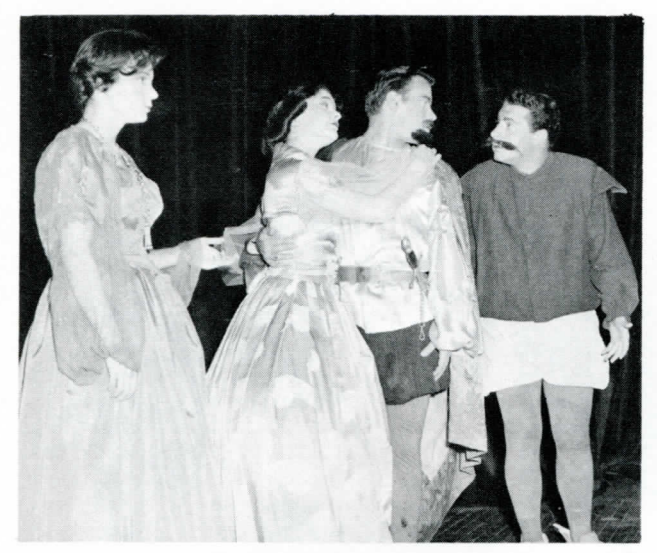
The Yankton College Theatre of the Department of Speech and Drama presents . . .