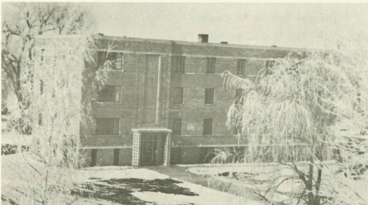
HEEMSTRA HALL Northwestern Junior College and Academy Orange City, Iowa March 8th, 1951