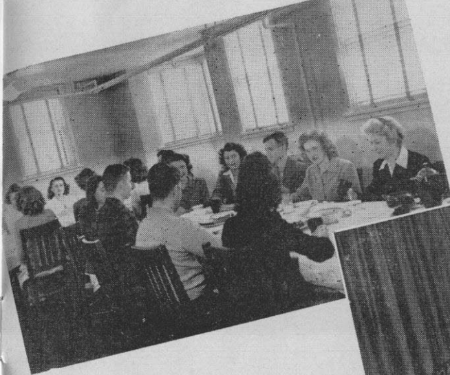
Food is good and plentiful at the College dining hall